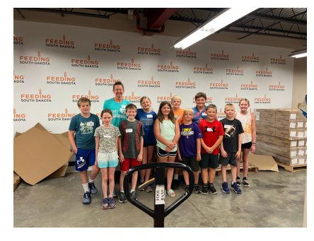
COMPASS POINTS ADVENTURE @ RAINBOW TRAIL LUTHERAN CAMP